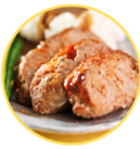
JAN. 15 Meatloaf