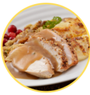
JAN. 29 Turkey Dinner