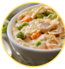
JAN. 22 Chicken ala King