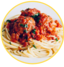
JAN. 8 Spaghetti