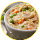
JAN. 22 Chicken ala King