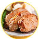
JAN. 15 Meatloaf