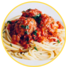
JAN. 8 Spaghetti