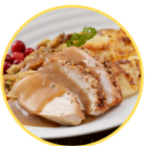
JAN. 29 Turkey Dinner