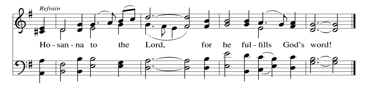
SCRIPTURE READINGS: Zachariah 9:9-10, Philippians 2:5-11, Matthew 27:27-31