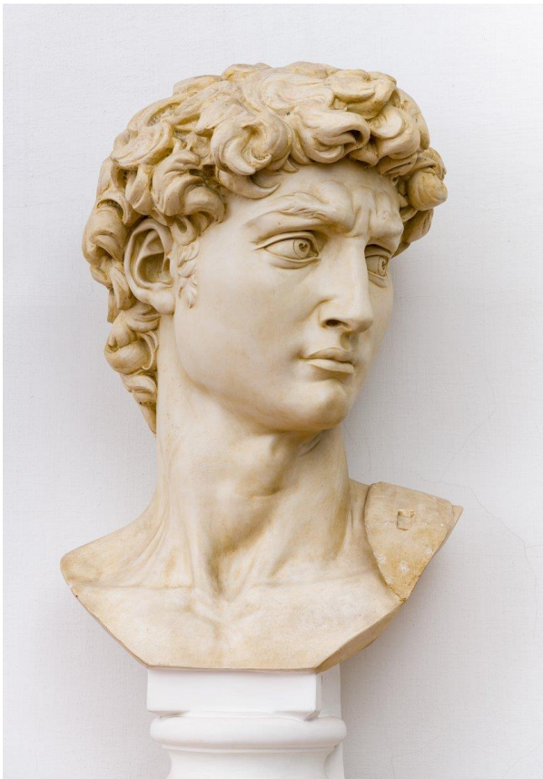
David (bust) Michelangelo