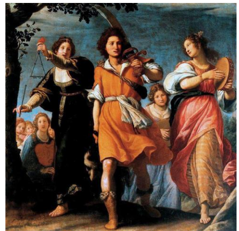
Matteo Rosselli, 1620 The triumphant David Galleria Palatina, Florence