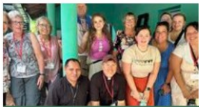
EL SALVADOR MISSION