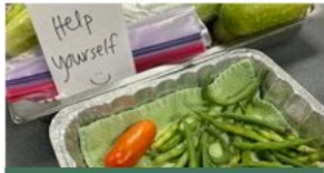
GARDEN OF GRACE